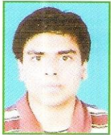
Kislai - IIT (Kharagpur)